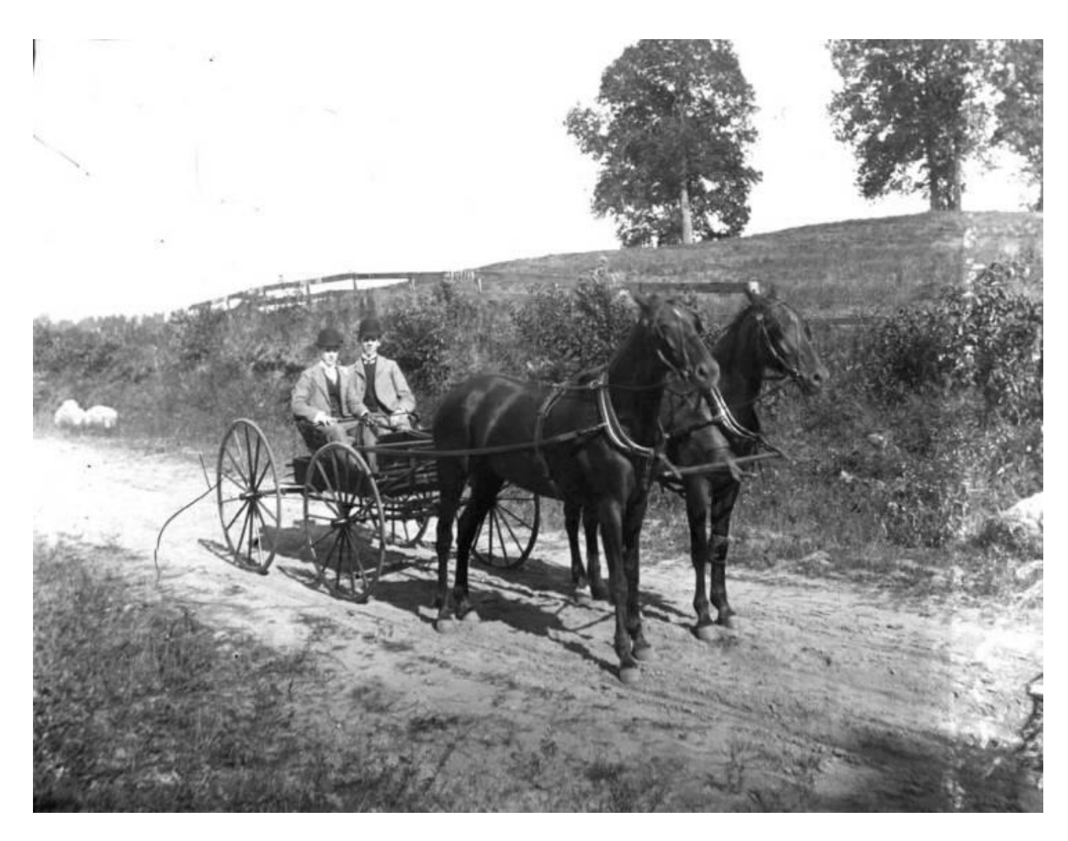
Men in Open Carriage Southport, CT 1890s, 1900?