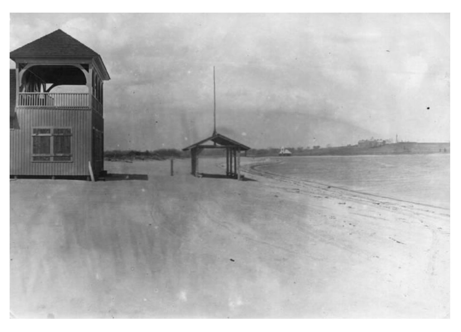
Rescue Station and Church, Black Rock Shore Bridgeport, CT Early 1900s?