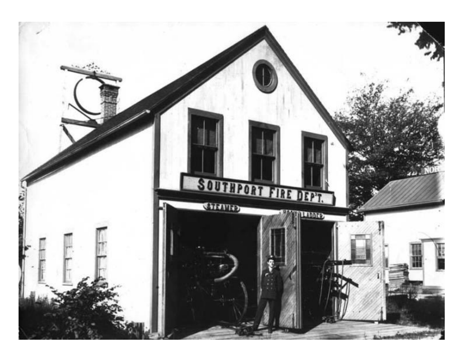
Southport Fire Department Southport, CT 1899