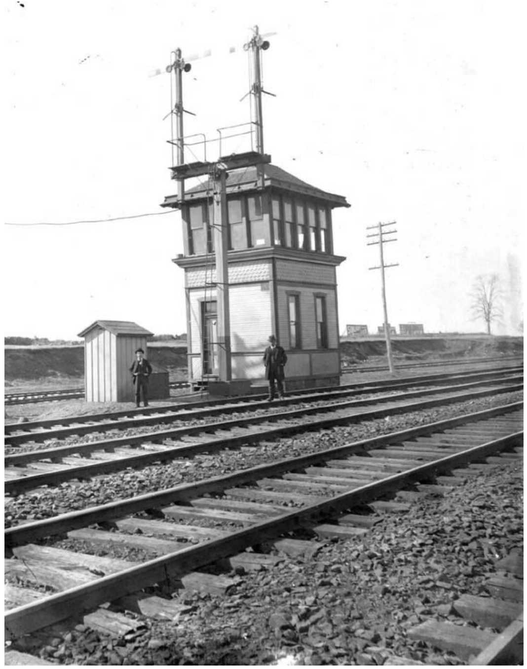
Railroad Block House Southport, CT