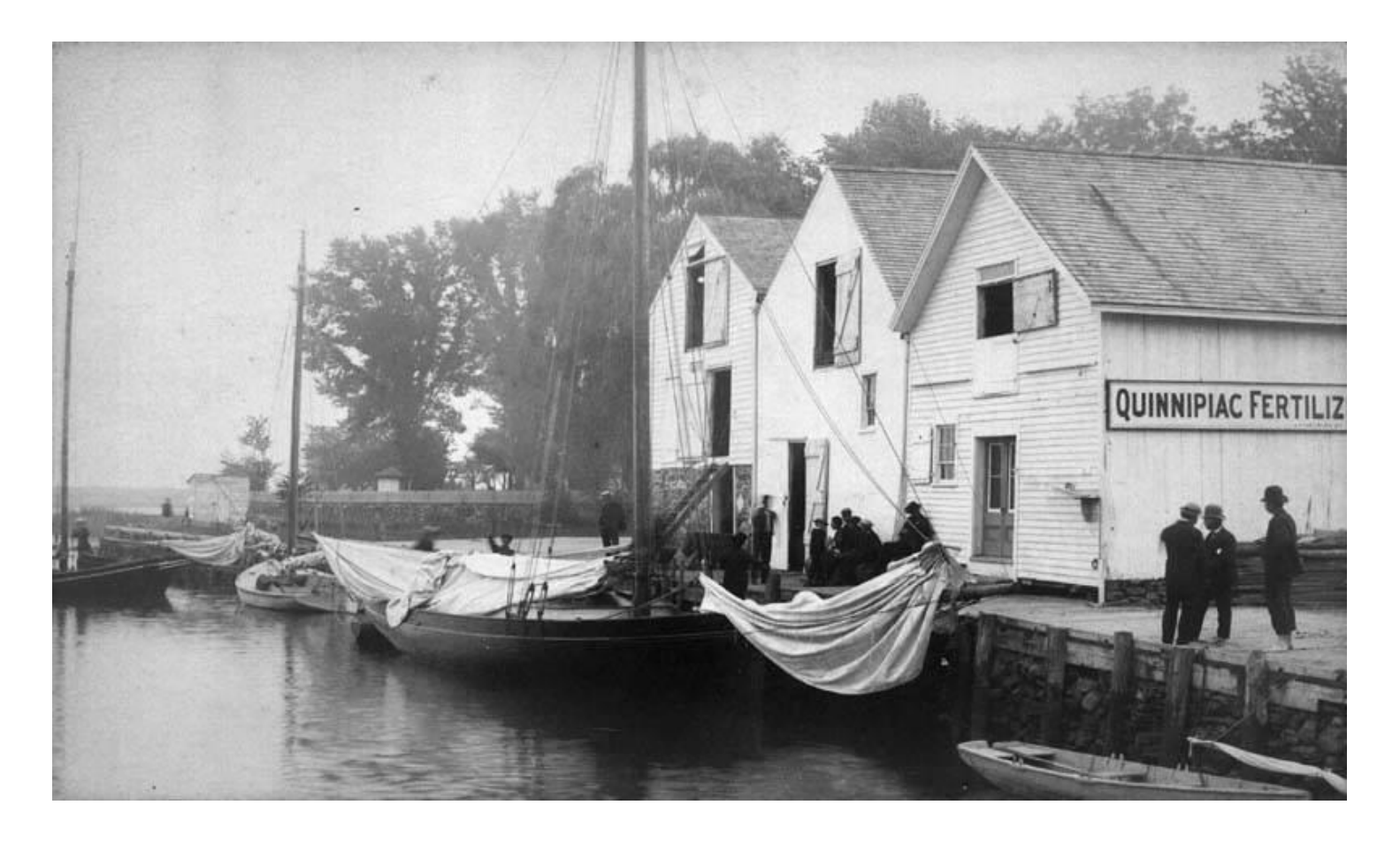
Meeker Warehouses Southport, CT 1887