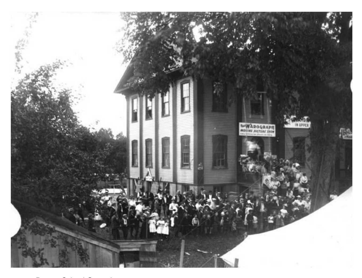
Pequot School Grounds Southport, CT Early 1900s