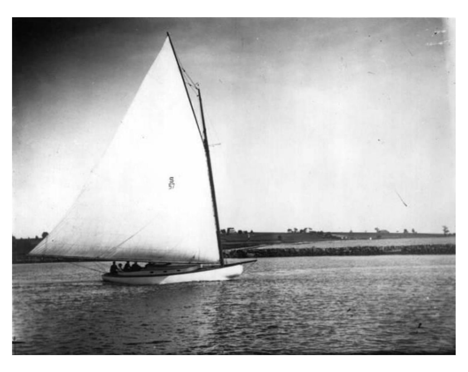
Sailboat, Southport Harbor Southport, CT ca. 1890s